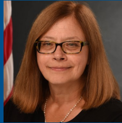
Elinore McCance-Katz First HHS Assistant Secretary for Mental Health and Substance Use